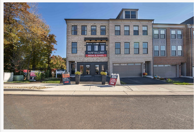
Clarion model home at The Retreat at Westfields

Brimming with exceptional features and elegant design, this move-in-ready