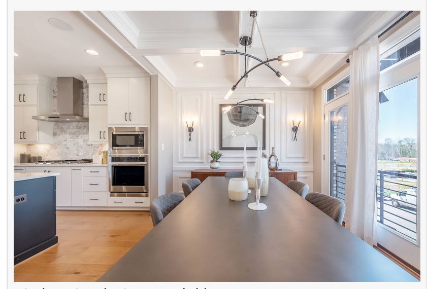
Kitchen in Clarion model home