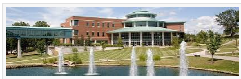
UMSL - Home of Supply Chain Risk and Resilience Research Institute

ST. LOUIS, MISSOURI, USA, July 10, 2023 /EINPresswire.com/ -- A first of its kind crisis management collaboration will feature representatives from industry, federal government, state government,