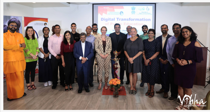
Speakers and Volunteers at C20 Education Working Group Summit in Atlanta, USA