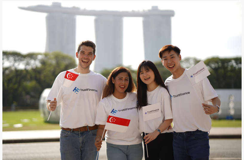
TrustFinance-Financial Review Platform