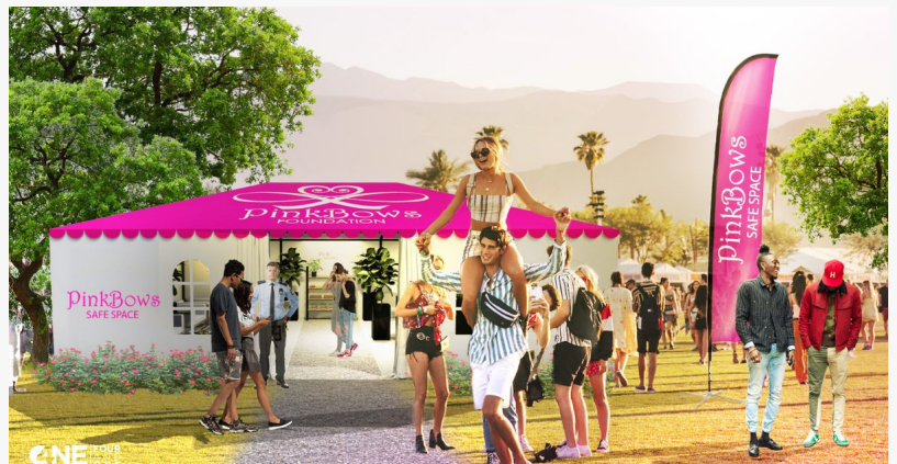
Pink Bows Safe Space