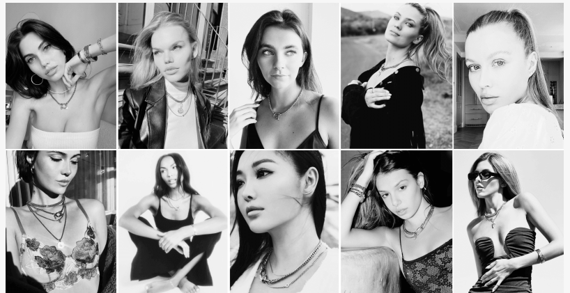
Artizan Reaches 100K on Instagram