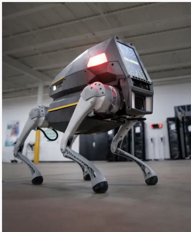
RAD Dog Robotic Security

On June 29th AITX announced that it has recently booked 6 orders for a variety of security solutions. These orders, totaling 51 devices, are being facilitated through one of the largest AITX authorized dealers.