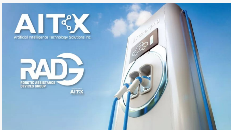
$AITX RADG EV Station

The event is meant to showcase the AITX RADD OG family of robots to area law enforcement personnel that may be considering adding advanced robotics to their force. AITX recently announced that it is taking pre-orders for RADD OG 2LE, specifically designed for law enforcement applications. The AITX RADD OG 2LE is a critical evolution of quadruped robotics positioned to improve the capabilities of law enforcement agencies and enable them to apply practical robotics for a variety of tasks. With its agile quadruped (four-legged) design and cutting-edge external accessories, RADD OG 2LE empowers officers to conquer challenging terrain, reach inaccessible areas, and navigate through dangerous environments.