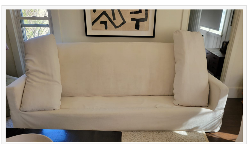
Encino Upholstery Cleaning

If you prefer a more eco-friendly approach to upholstery cleaning, there are several natural and non-toxic cleaning solutions you can try. Here are