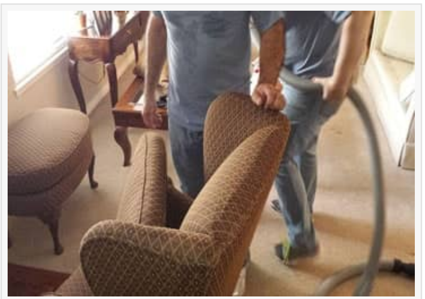
Upholstery Cleaning Wing-Backed Chair

Section 4: Hiring Professional Upholstery Cleaning Services While DIY cleaning methods can be effective for regular maintenance, there are times when professional upholstery cleaning is necessary.