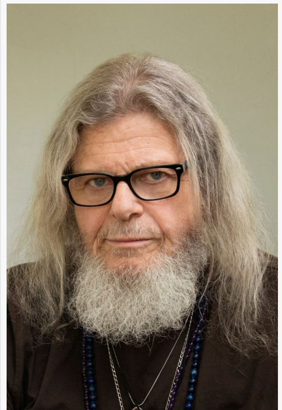
TWO-TIME OSCAR WINNING FILM AND TELEVISION COMPOSER, PROLIFIC SINGER-SONGWRITER AND VISIONARY PRODUCER GUSTAVO SANTAOLALLA PERFORMS A UNIQUE SOLO PRESENTATION FOR AVENI FOUNDATION

approved 501(c)(3) public charity whose mission is to expedite the development of gene-targeted therapies for cancer and other unmet medical needs. The first product is a tumor-targeted gene therapy, DeltaRex-G, that is FDA authorized for Expanded Access to an intermediate size