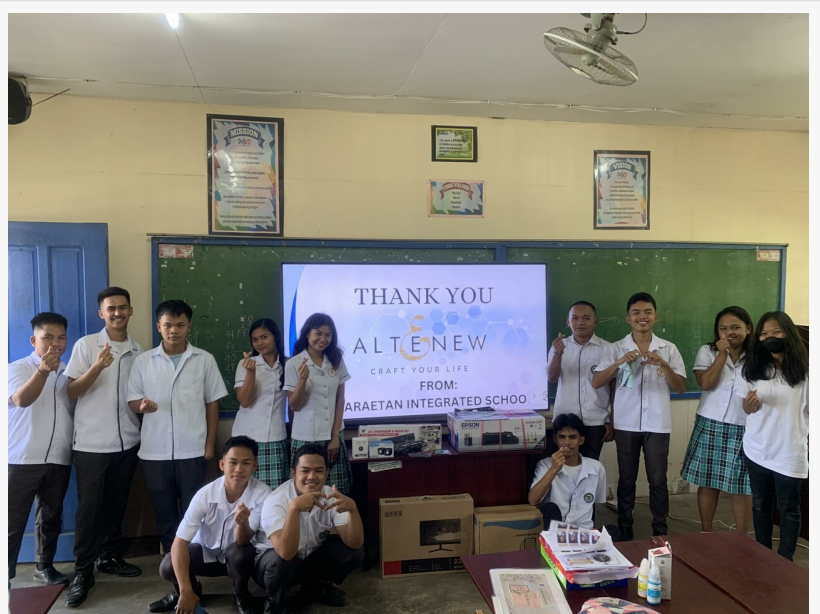
Students at this rural public school library in Tanay, Rizal, Philippines thank Altenew.