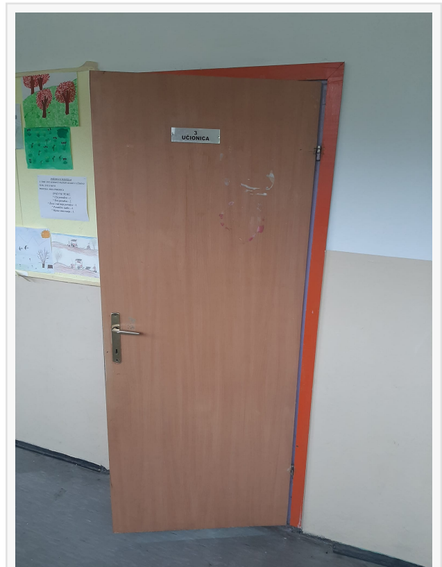
One of five brand-new doors installed by Altenew at this elementary school in Bosnia.