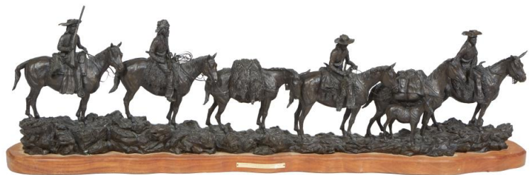
Patinated bronze by Truman Bolinger (Ariz./Wyo., b. 1944), titled Heading for the Green River Rendezvous (1975), signed and numbered ("8/13") and dated (est. $4,000-$8,000).