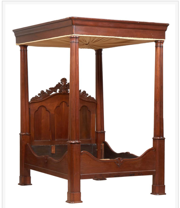
American 19th century carved walnut full tester double bed, possibly Louisiana, the ogee rounded corner tester with a cloth insert, on a four-cluster column post (est. $2,500-$4,500).

An American 19th century carved walnut full tester double bed, possibly Louisiana, the ogee rounded corner tester with a cloth insert, on a four-cluster column post, flanking a three-panel headboard, with a carved leaf, floral and scroll carved crest, should command $2,500-$4,500.