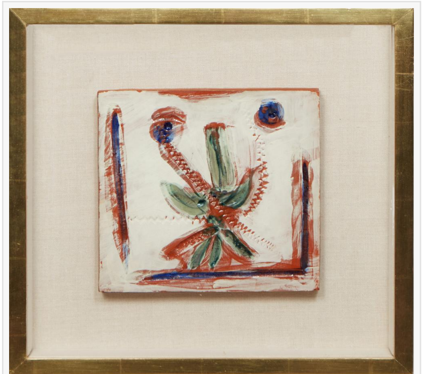
Painted and partially glazed ceramic tile by Pablo Picasso (Spanish/French, 1881-1973), is titled Visage au Nez Vert (1968) and presented in a giltwood shadowbox (est. $2,500-$3,500).