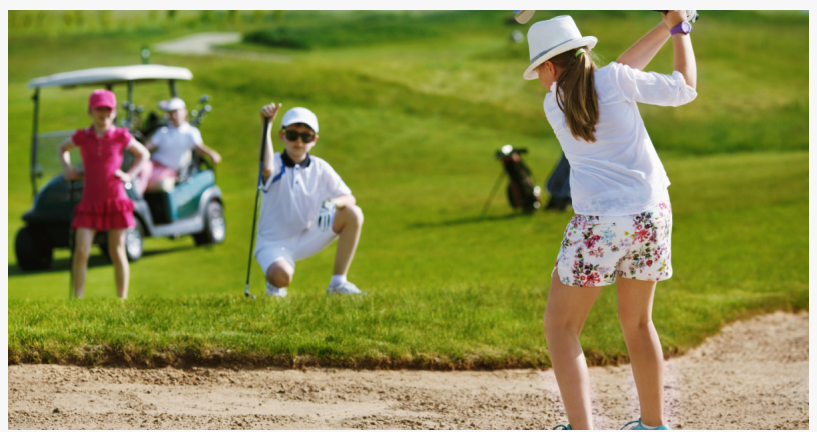
Kids on the Green

RALEIGH, NC , UNITED STATES , July 13, 2023 /EINPresswire.com/ -- What an amazing day at Lonnie Poole Golf Course in Raleigh, NC a couple of weeks ago! It was no ordinary day on the driving range at all. The Raleigh, NC ETA Sigma Chapter of Phi Beta Sigma Fraternity presented the Sigma Scholars Foundation, Inc during this Celebrity Golf Tournament & Scholarship Banquet . It was astonishing to see several kids with First Tee- Triangle, an organization that empowers youth through golf, playing their hearts out. This organization is having a positive impact with kids in the Triangle by teaching them life and leadership skills. One of the students in attendance has a full scholarship to college this Fall to play golf. On Monday, June 26th, with a Shotgun Start of 10:00am, First Tee- Triangle held their annual Old Chatham Golf Tournament presented by Valero Energy, to raise funds for their youth programs.