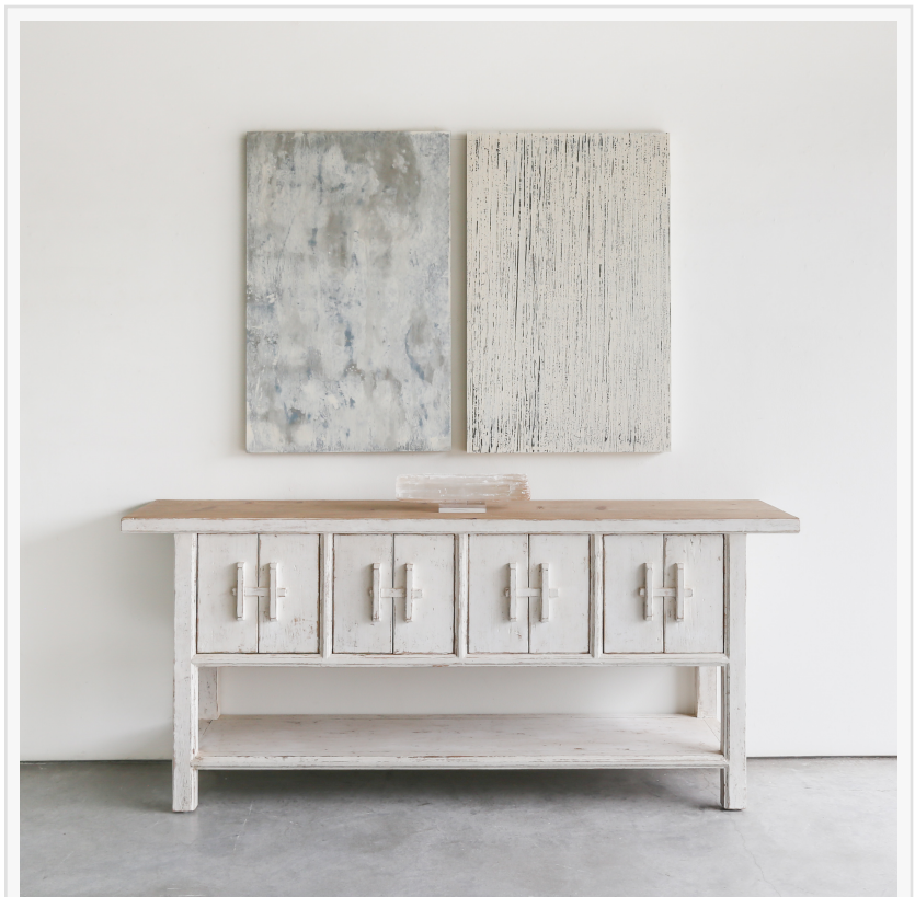
Artwork : "Soft Day 1"