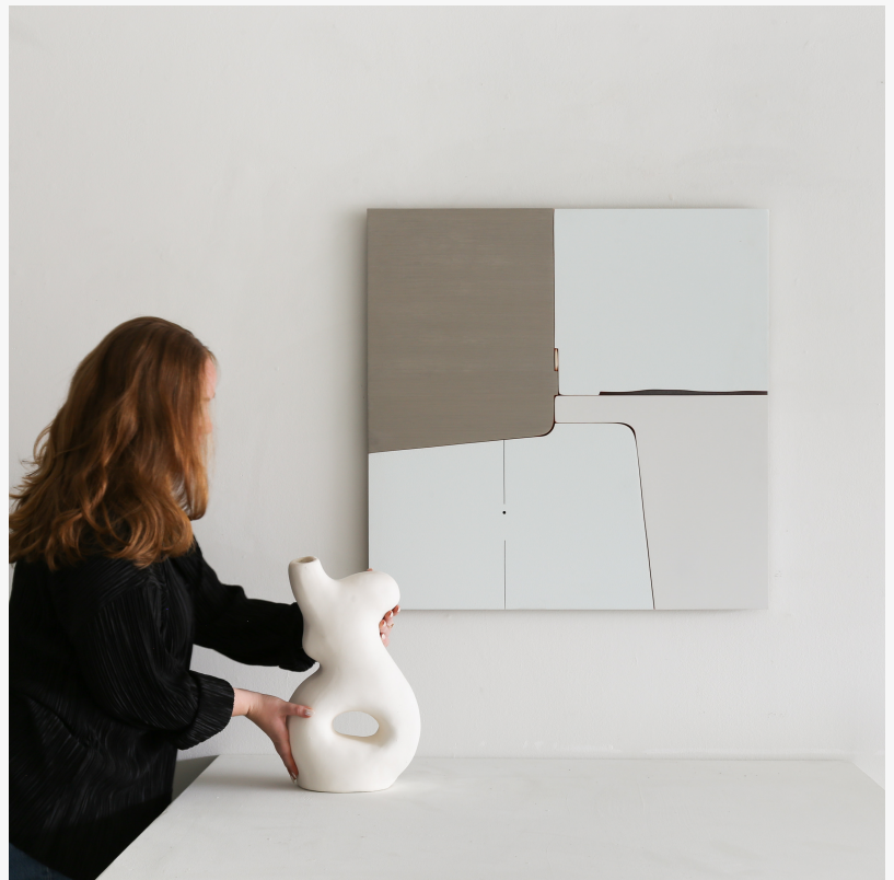
Artwork : "Hidden Energy 1"