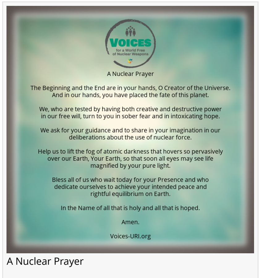
A Nuclear Prayer

Additional events include a global zoom room with a compilation video of prayers from the seven continents for a world free of nuclear weapons, with a space provided for discussion, reflection and community that people can join in. These events will take place on August 5th at