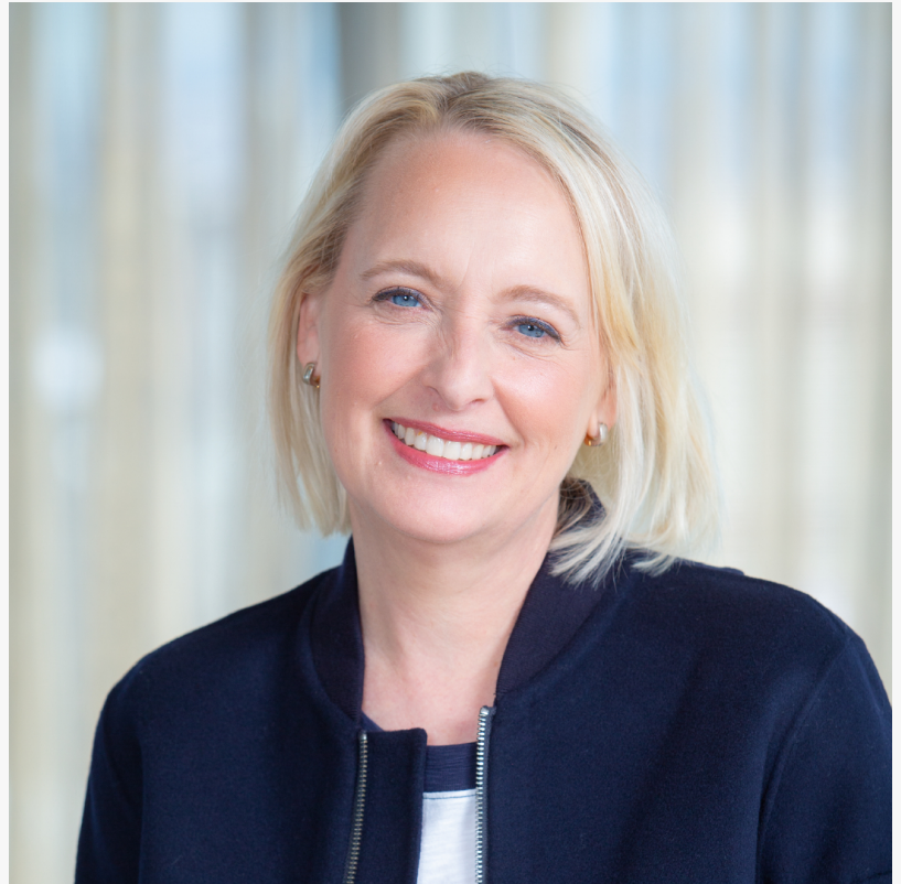
Julie Sweet – Chair and Chief Executive Officer of Accenture