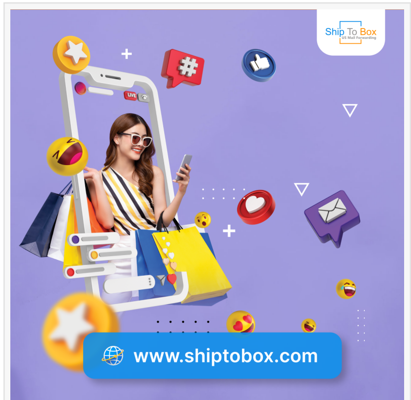
Amazon Prime Day

ShiptoBox.com is an AI-enabled global e-commerce platform that provides comprehensive e-commerce logistics solutions for businesses and individuals. With its advanced technology, global hub network, and strategic partnerships, ShiptoBox.com offers efficient and reliable shopping and shipping