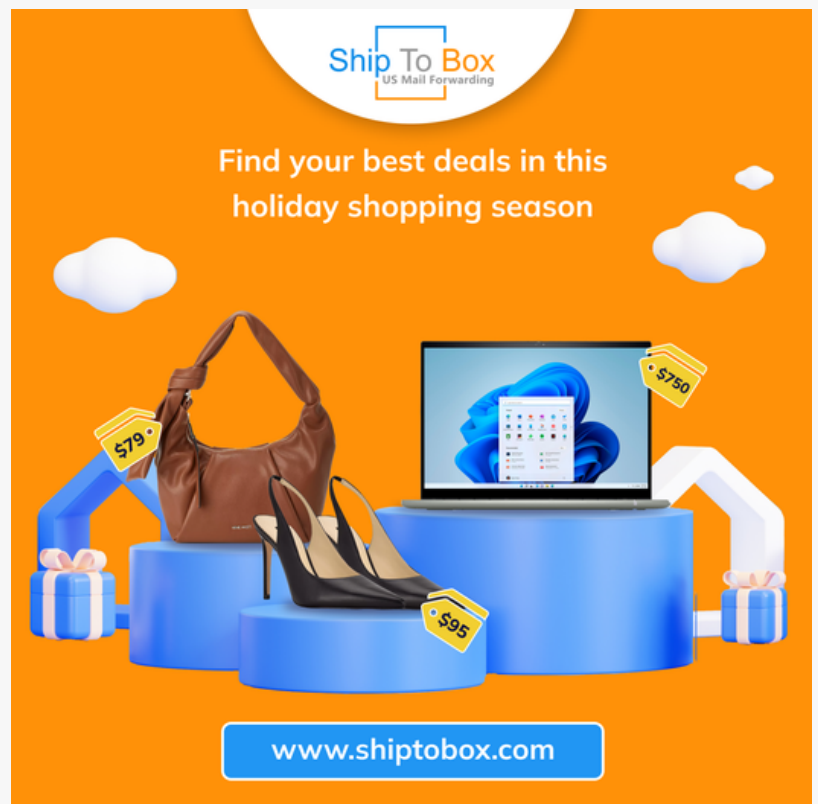
Amazon Prime Day