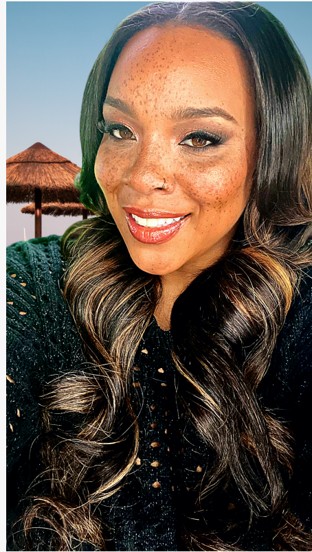
Travel blogger and entertainment celebrity