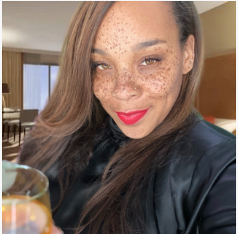
Briana Latrise, star of Growing Up Hip Hop

Briana's influencer stats for social media is over 1 million followers and over 15 million reach. Briana is also open for interviews. Contact AIMPR.co@gmail.com for more info.