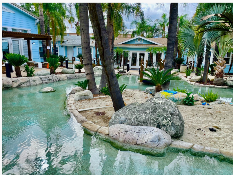
The We Level Up California Rehab Center is Accredited, Licensed & Top-rated option for behavioral health disorders.

The network's WeLevelUp.com website and services are A-rated by the BBB as a confirmed and