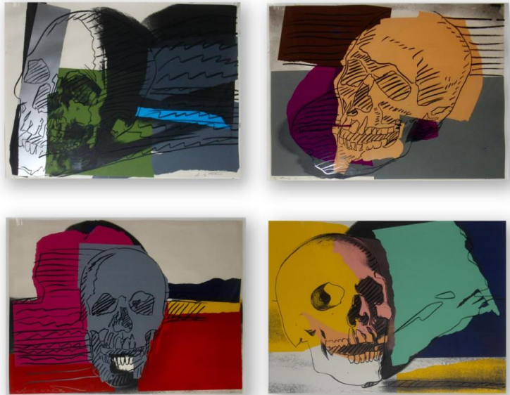
Portfolio of four screenprints in colors by Andy Warhol titled Skulls, each measuring 40 inches by 30 inches (sight, less frame) and each signed and pencil numbered (est. $125,000-$175,000).

The Philip and Kelvin Laverne pieces include a wall plaque with a wonderfully well-done image of a Chinese village, 17 inches tall by 60 inches long and signed lower center (est. $40,000-$60,000); an etched bronze coffee table in an unusual and rare geometric pattern (est. $8,000-$12,000); and an end table in an Oriental motif, 18 inches in diameter (est. $6,000-$8,000).