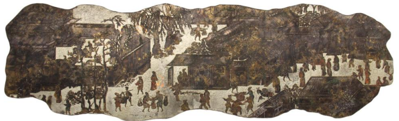
Philip and Kelvin Laverne wall plaque with a wonderfully well-done image of a Chinese village, 17 inches tall by 60 inches long and signed lower center (est. $40,000-$60,000).