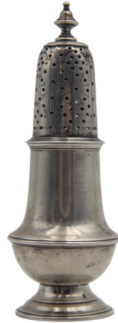
Paul Revere sterling silver pepper pot, 5 ½ inches tall and weighing 129 grams, hallmarked at the bottom with four “PR” initials in block letters, plus the letters “F W E” (est. $20,000-$30,000).

An acrylic on canvas painting by the Japanese born American abstract painter Kikuo Saito (1939-2016) with ties to the Color Field movement, titled Petipa’s Umbrella, signed on verso and dated 1992, measuring about 32 ¾ inches by 42 inches, should realize $8,000-$12,000.