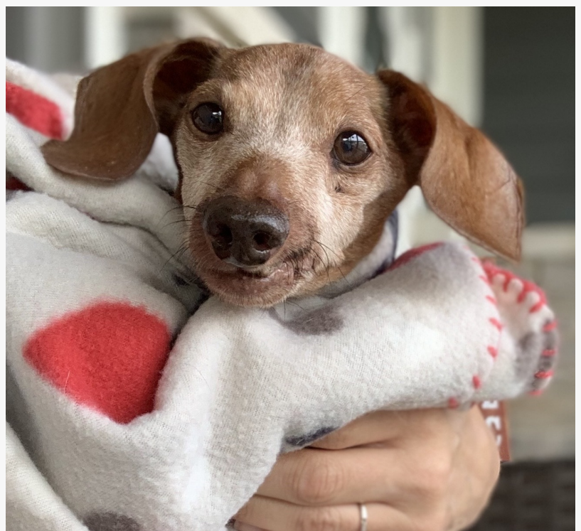
Fifteen-year-old Lincoln is among many "super seniors" who will receive the dental and medical care they need to be ready for adoption.

Lincoln. Young at Heart's Grey Muzzle grant will provide super senior dogs with all the advanced dental and medical care they need before matching them with adopters.