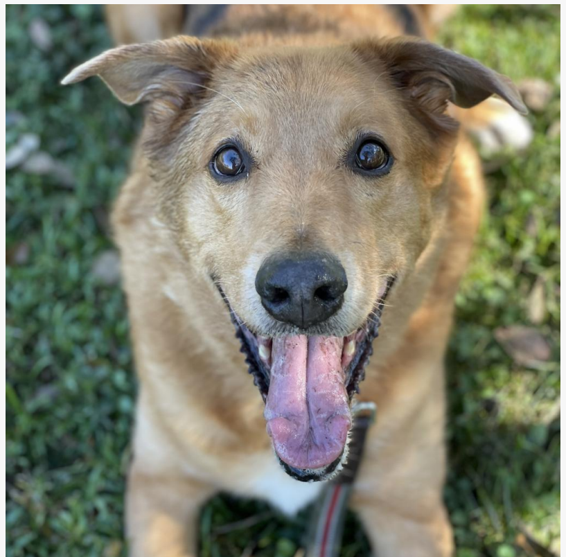
Senior dogs like Brian will stay in loving homes and out of shelters, thanks to a Grey Muzzle grant.

The new grantees, selected from 370 applicants, will use the funds to help save and improve the lives of at-risk senior dogs in their communities. These grants will provide critically needed medical and dental treatment; foster and hospice care; adoption promotions; and programs that help keep old dogs in loving homes and out of animal shelters.