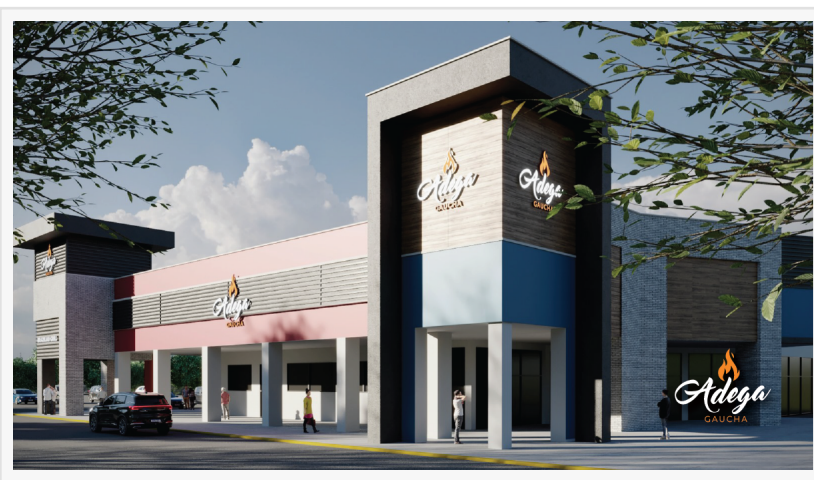
Kissimmee location - Adega Gaucha

KISSIMMEE, FLORIDA, UNITED STATES, September 12, 2023 / EINPresswire.com/ -- Adega Gaucha, the beloved Brazilian steakhouse renowned for its exceptional dining experiences in Orlando, is excited to announce the upcoming opening of its newest branch in the vibrant city of Kissimmee, Florida, located at Formosa