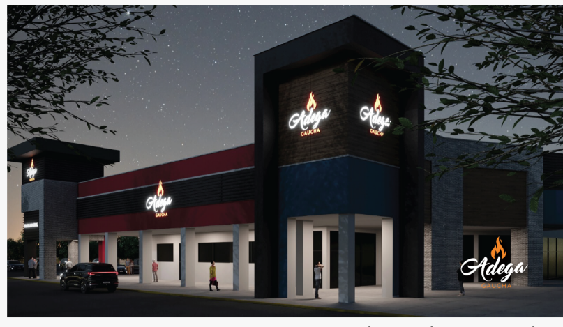
New Location in Kissimmme at Night - Adega Gaucha

The new location, spanning almost 9,000 sq ft and accommodating around 250 seats, will boast a modern and