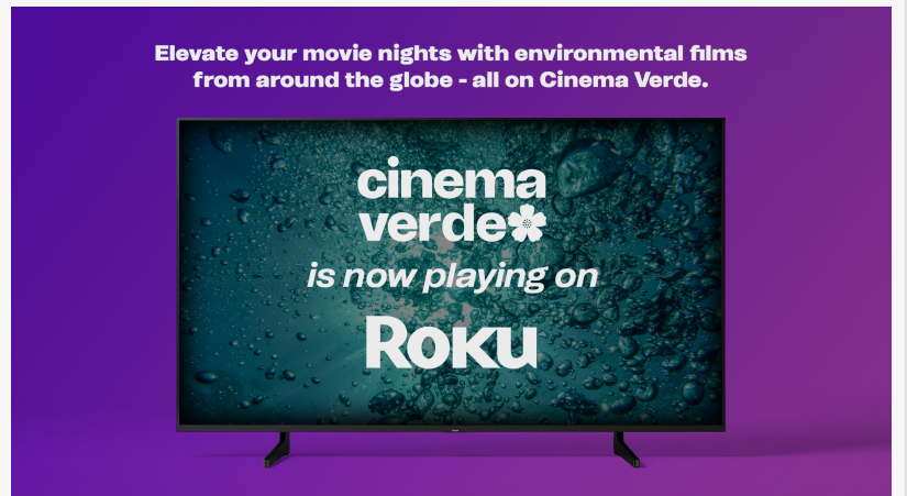
Cinema Verde Now Playing

This means that if you have a Roku device (about $25 at your favorite electronics store) or a Roku TV, you can tune in to watch Cinema Verde films for no additional cost. And whenever you have your TV tuned in to the Cinema Verde Channel, you will be supporting Cinema Verde filmmakers and the work to bring this information to your attention. Cinema Verde has an amazing team dedicated to bringing a wealth of valuable and informative films to citizens worldwide as they work to forge a healthier future, and public support helps to make this happen.