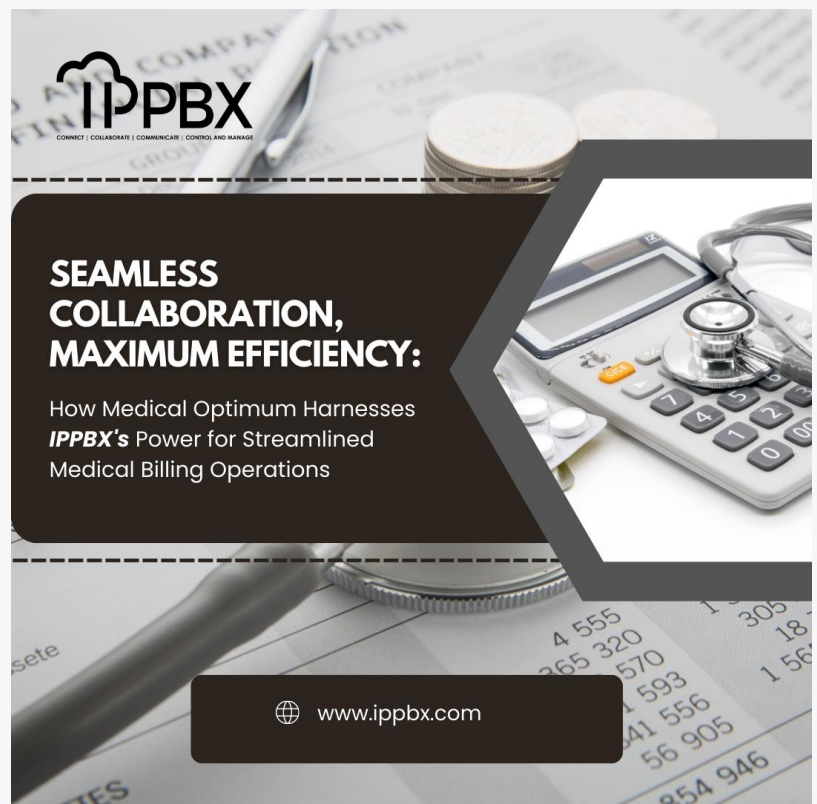
Seamless Collaboration - Maximum Efficiency