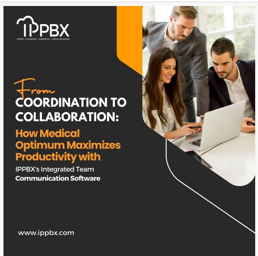
From Coordination to Collaboration

Another prominent software feature Medical Optimum has benefited from is the state-of-the-art file-sharing system. Given the sensitive nature of medical information, the need for a secure file-sharing mechanism is paramount. IPPBX's software facilitates sharing within and outside the organization with password protection and optional video verification, reinforcing data security.