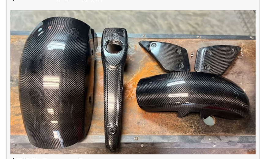
$EVVL Custom Parts