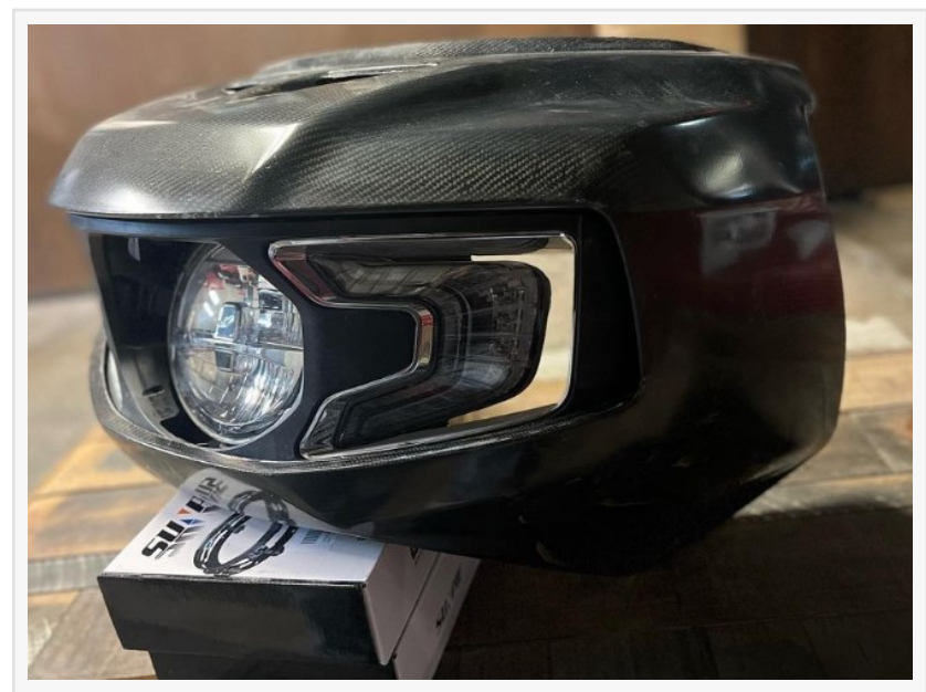
$EVVL #Indian Custom

For more information on $EVVL visit: <a href="https://www.evilempiredesigns.com">www.evilempiredesigns.com</a>