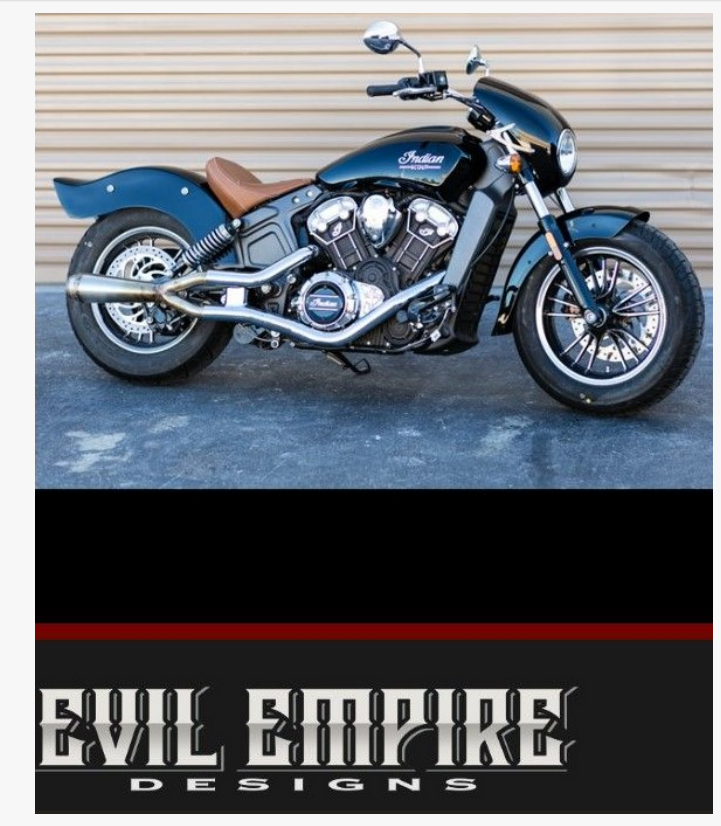
$EVVL #Indian Mods

On June 26th EVVL announced that it has entered into a definitive Share Exchange Agreement with Trendmark Industries, Inc. and the sole stockholder of Trendmark, under