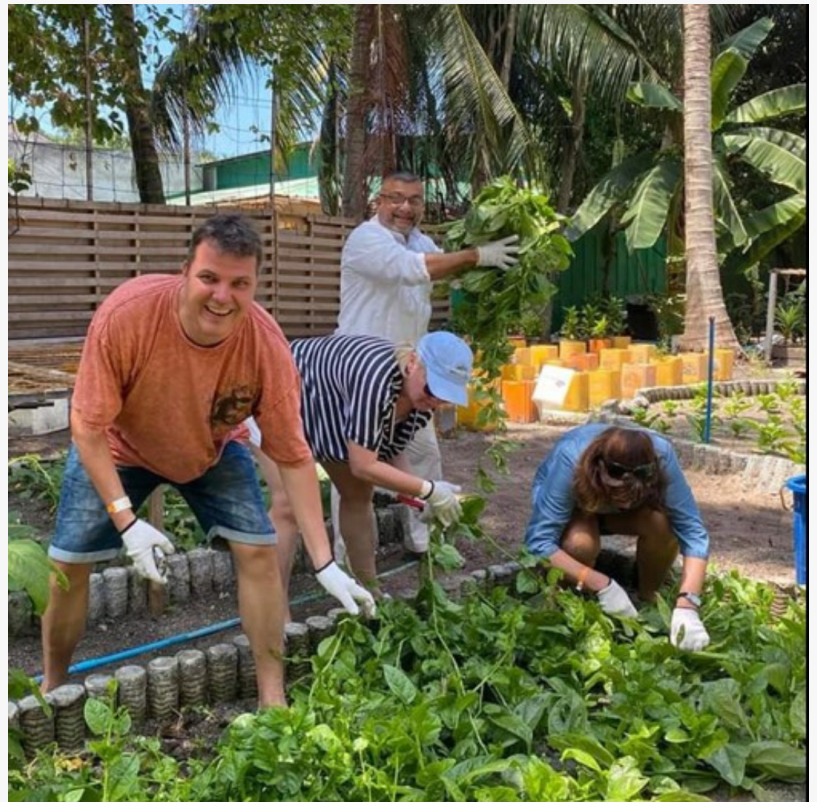
Organic garden at Ellaidhoo Maldives by Cinnamon

In the face of increasing climate change challenges, the Maldives has experienced more frequent soil erosion, loss of beaches, and saltwater intrusion into land and freshwater sources. The Cinnamon Hotels & Resorts play a vital role in coral reef preservation, contributing to safeguarding 3% of the world's coral reefs, including the