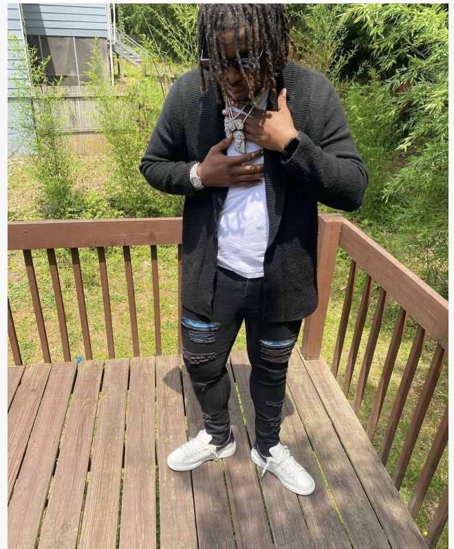
Bloxk Baby photoshoot fresh