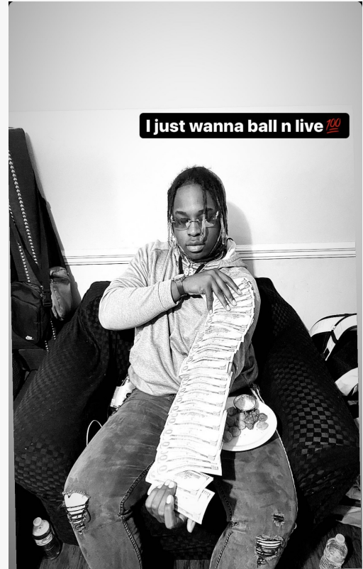
bloxx baby balling and living