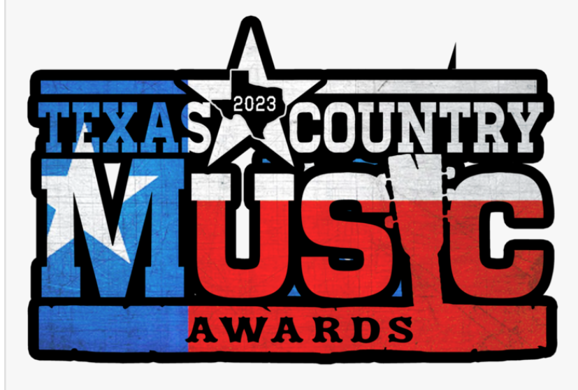
Texas Country Music Awards Logo