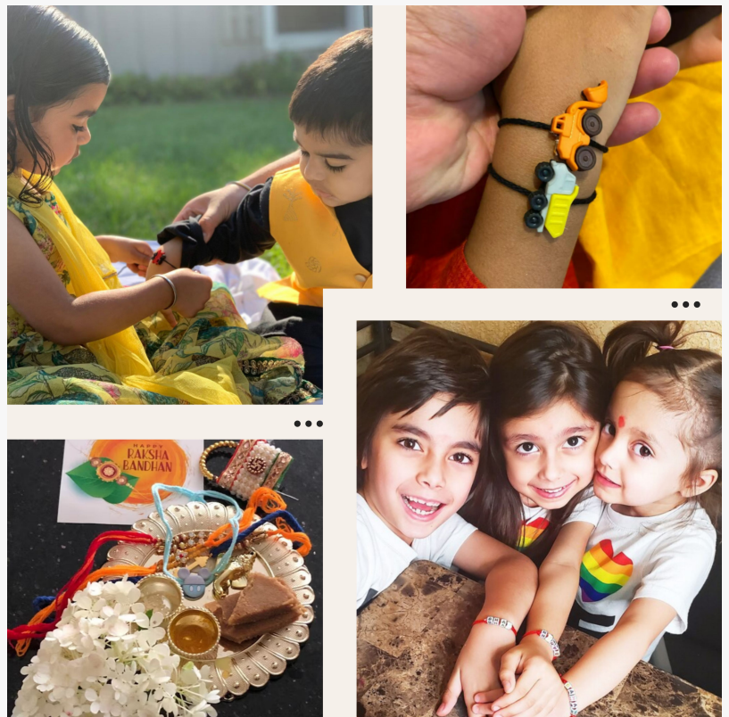
Kids Rakhi Collection, Customer photos