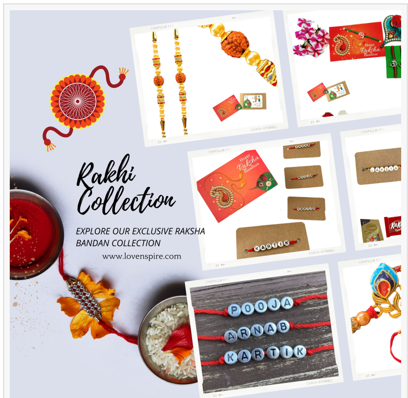
Rakhi Collection, Name Rakhi, Designer Rakhi, Rakhi Gift Hampers

auspicious day. Crafted with love and care, these Rakhis feature fun and colorful designs that