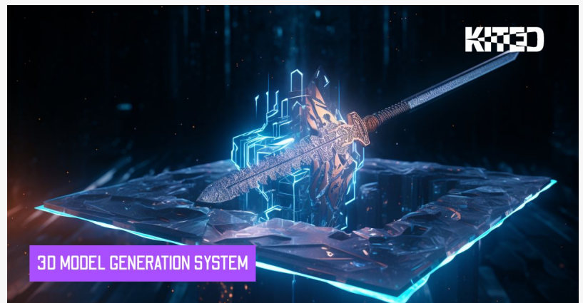
A symbolic depiction of AI: a Kited neural network symbolizing artificial intelligence, connected to a screen where a 3D model appears.

In keeping with the decentralization and transparency principles of Web3.0, all game items within Kited will be tokenized as Non-Fungible Tokens (NFTs). Each item will possess its unique rarity level, facilitating the creation of a dynamic in-game market economy that mirrors real-world economic systems, fostering a truly engaging and authentic gaming experience.