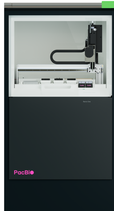
Revo System by PacBio