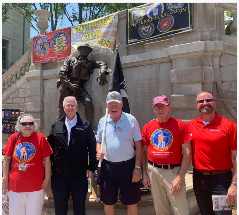
Monument Terrace Troop Rally

Emord commits to introduce legislation in the U.S. Senate that will end the anti-incarceration agenda of Soros-backed prosecutors nationwide; to make it a Class B Felony for candidates for prosecutor or commonwealth's attorney to conspire with funding sources to implement anti-incarceration agendas in violation of the Hobbs Act and laws prohibiting obstruction of justice; to end defund the police movements nationwide; and to provide tax relief for spouses of Armed Forces, policemen, firemen emergency medical technicians, and paramedics killed in the line of duty.