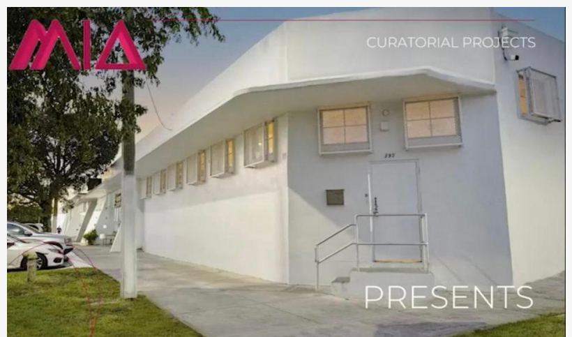
Gallery at Little Haiti, Miami