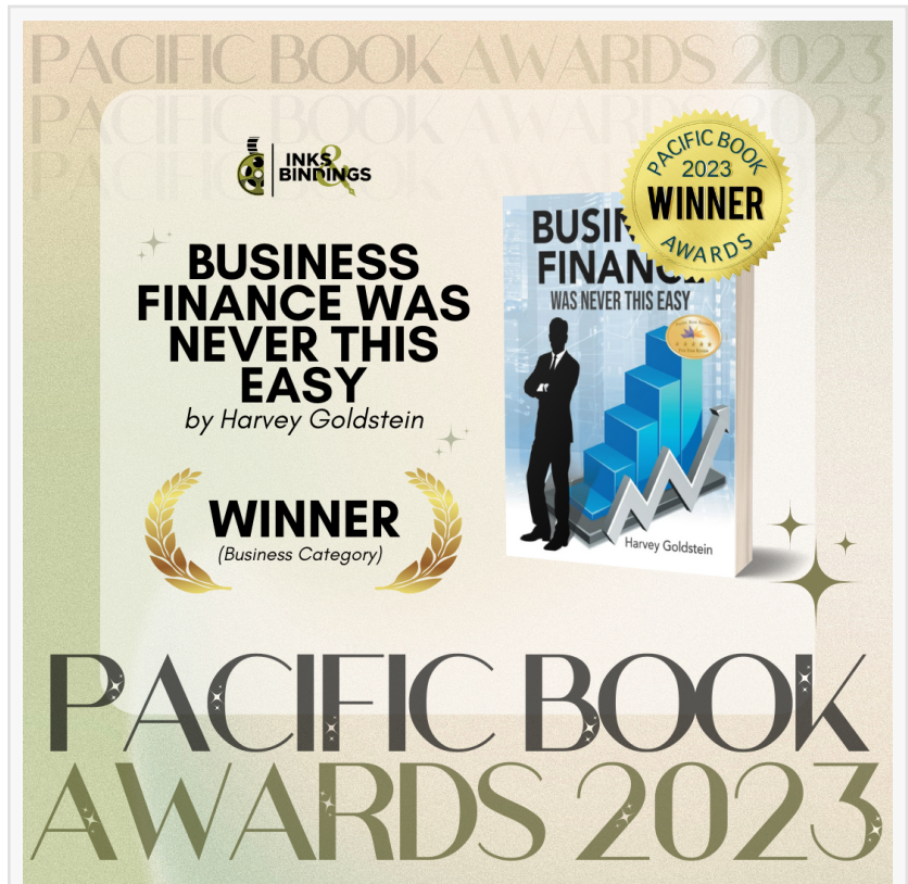
2023 Pacific Book Awards Winner for Business Category