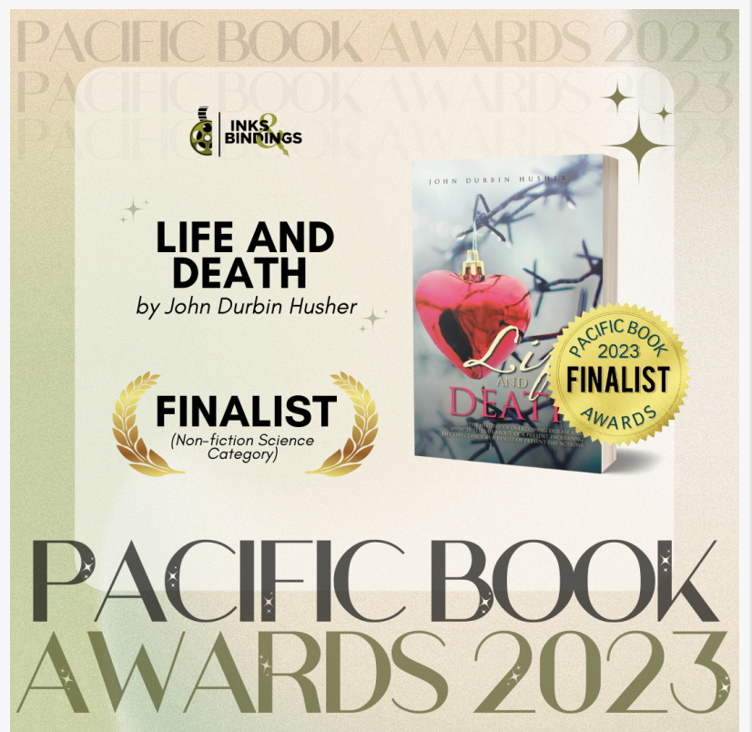
2023 Pacific Book Awards Finalist for Non-fiction Science Category