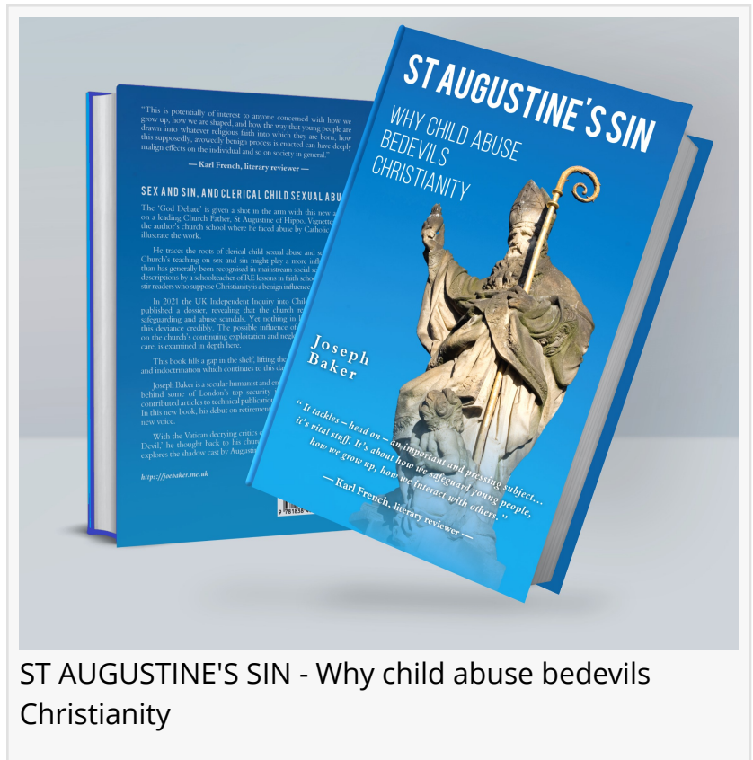
ST AUGUSTINE'S SIN - Why child abuse bedevils Christianity

/EINPresswire.com/ -- In June 2023, the Church of England sacked the panel of experts who provided independent oversight of how it dealt with abuse. Yet in 2021 the UK Independent Inquiry into Child Sexual Abuse disclosed that 100 new cases of clerical abuse are being reported every year . Around the same time, an inquiry in France reported that children are more likely to be abused within Church settings than in state schools, holiday camps and sporting organisations.