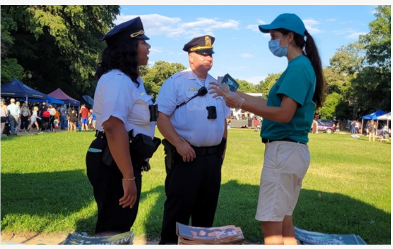
Foundation for a Drug-Free World works with police officers on drug education

informed so they avoid making a decision that could cost them their lives and bring hurt and pain to their families and loved ones.