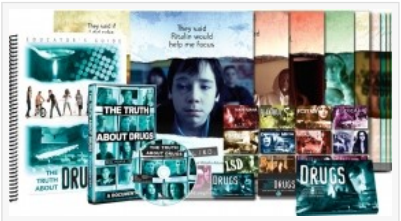
Drug-Free World provides materials for free in 22 languages. The Truth About Drugs is a series of fourteen illustrated drug information booklets containing facts about the most commonly abused drugs.

In addition, Foundation for a Drug-Free World provides <u>powerful PSAs</u> which are videos exposing the truth about drugs. There are sixteen anti-drug public service announcements that can be watched at <u>www.drugfreeworld.org</u>. The PSAs serve as powerful openers for drug education presentations, as well as the perfect introduction to the foundation's series of factual and compelling drug education booklets. This combination has proven to be an effective way to get students interested in learning the truth about drugs and, more importantly, gives them