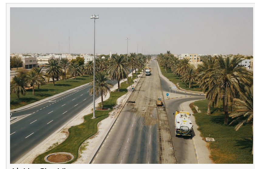
Al Ain City View

"We are excited to announce our expansion to Al Ain, which is a strategic move for our company. We see great potential and demand for our services in this city, which is one of the cultural and economic hubs of the UAE. We are confident that we can offer our customers in Al Ain the same level of