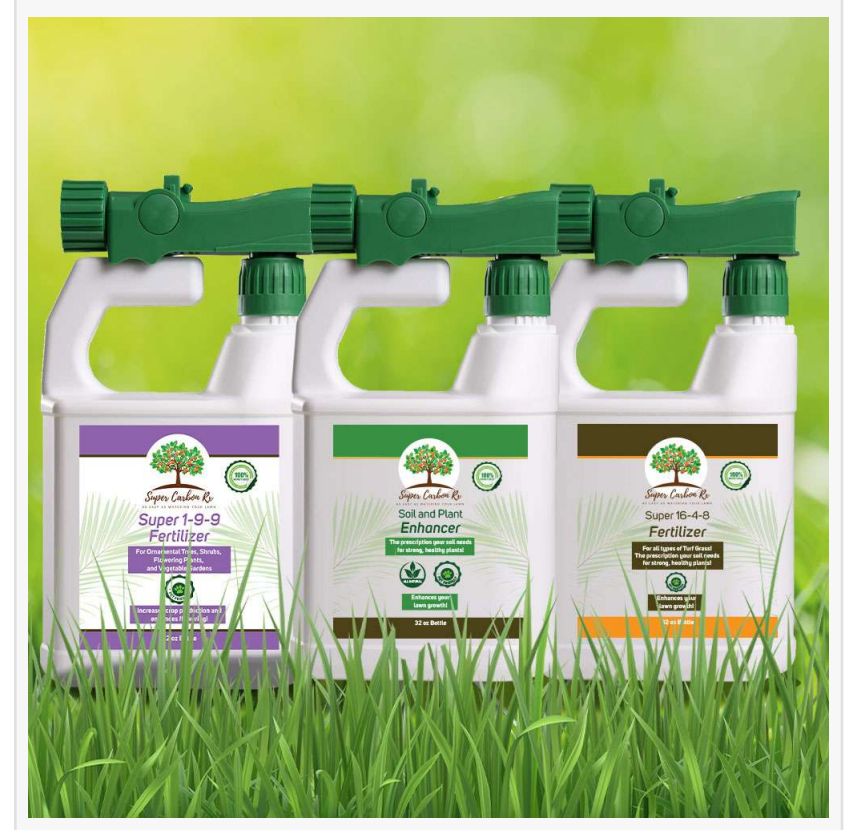
Trusted Fertilizer Company

needs of green spaces and enable customers to select the most appropriate fertilizer for their lawns or ornamental plants.