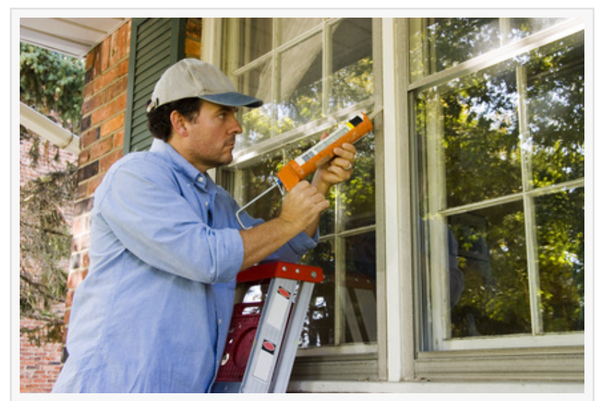
Home Improvement Tax Deductions

Under the updated tax regulations implemented for the year 2023, qualified home improvements are eligible for tax deductions.