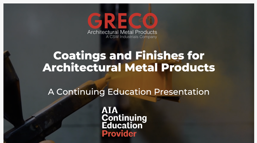
GRECO's continuing education program

TAMPA, FLORIDA, UNITED STATES, July 13, 2023 /EINPresswire.com/ -- GRECO Architectural Metal Products (GRECO), a leading manufacturer and supplier of architectural railings and metal products in North America, is proud to announce the release of its latest continuing education course for architects. The course, focused on metal coatings and finishes, has been approved by the American Institute of Architects ( AIA ) and offers one Learning Unit for Health, Safety, and Welfare.