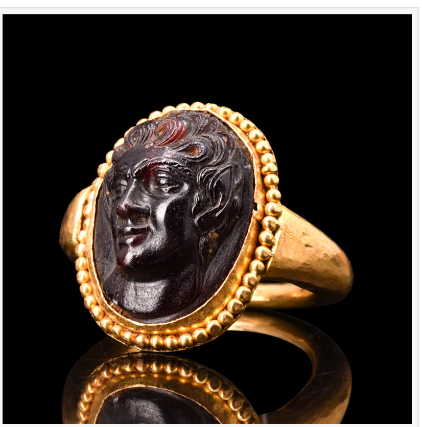
Ancient Roman amethyst cameo ring with a finely rendered portrayal of a satyr. Circa 4th-6th century AD.. Estimate £6,000-£9,000 ($7,700-$11,550)

A rare surviving relic from the days of Old Babylonia, a circa 1900-1600 BC cuneiform ceramic tablet in rectangular form is written in a very rare language: Hurrian. The Hurrian people first inhabited the Ancient Near East during the Early Bronze Age, and their language was spoken throughout northern Syria, upper Mesopotamia and southeastern Anatolia. This extraordinary antiquity from the First