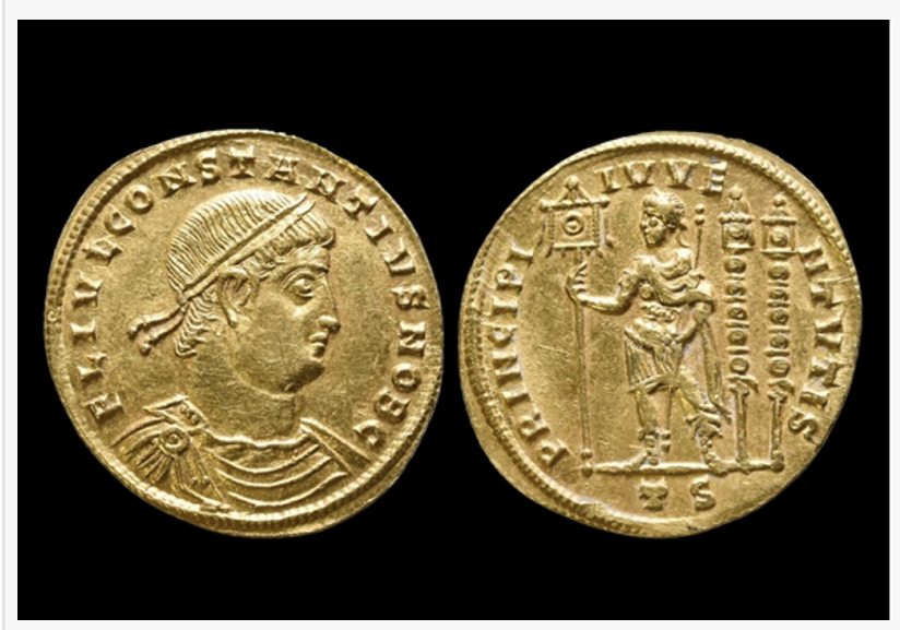
Rare Constantine II as Caesar AV solidus (pure gold coin), Thessalonica, 332-333 AD. Weight: 4.62g. Estimate £6,000-£9,000 ($7,700-$11,550)

Babylonian Empire measures 160mm by 50mm (6.3in by 2in) and is estimated at £6,000-£9,000 ($7,700-$11,550).