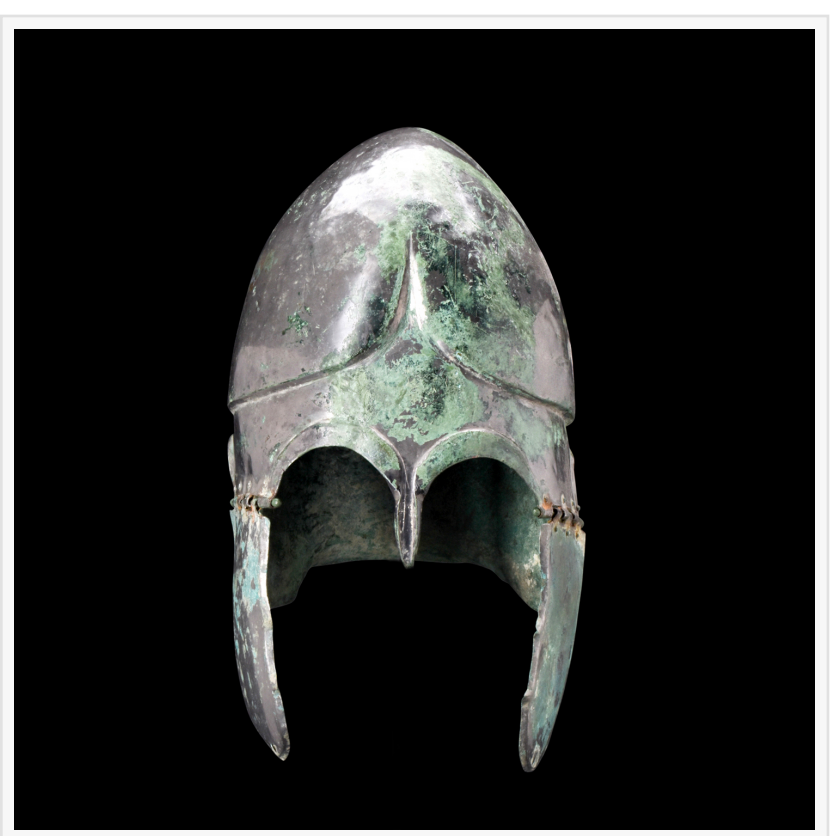
Greek Chalcidian hammered bronze helmet, circa 500-300 BC, contoured double curve above brow; hinged, articulated cheek guards. Estimate £15,000-£20,000 ($19,380-$25,840)

Many jewelry collectors have discovered the glorious designs of Roman goldsmiths through Apollo Art Auctions' sales. One of the company's finest selections of Roman and other