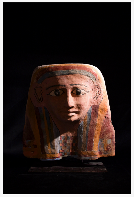
Egyptian face from wooden coffin lid, 26th Dynasty, circa 664-525 BC. Size: 410mm x 390mm (16.1in x 15.4in). Estimate £6,000-£9,000 ($7,700-$11,550)

Many forms of historical heavy metal will weigh in, starting with an incredible <u>Greek Chalcidian hammered</u> <u>bronze helmet</u> dating to circa 500-300 BC. Its unusual design incorporates a contoured double curve above the brow, and hinged, articulated cheek guards. By the time of the Peloponnesian War (434-402 BC), the Chalcidian helmet was the most widely distributed head protection seen in Greek military ranks. The auction example exhibits beautiful natural verdigris that only enhances its