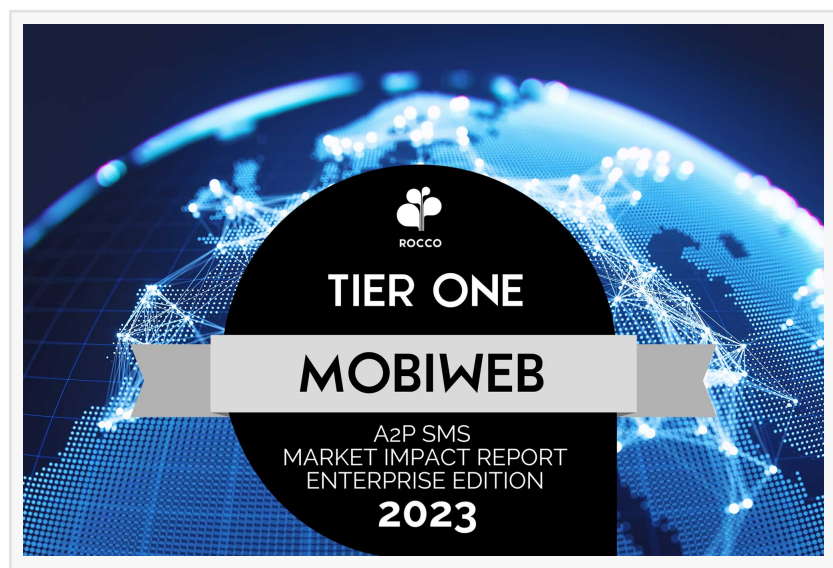
MobiWeb Receives Tier-One A2P SMS Messaging Provider Ranking

MONTREAL, CANADA, July 17, 2023 /EINPresswire.com/ -- In the rapidly evolving world of mobile communication, enterprises rely on effective and efficient messaging solutions to engage with their customers. A2P (Application-to-Person) SMS messaging has emerged as a powerful tool for businesses to reach a wide audience. Recognizing the significance of this technology, ROCCO,