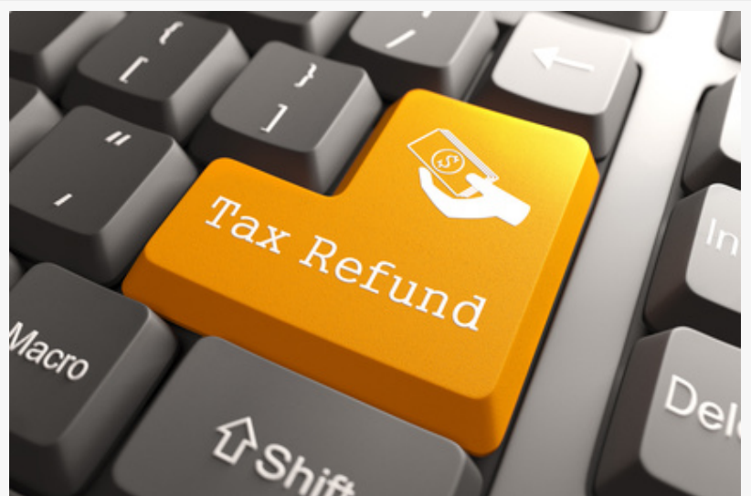
Tax refund calculator

This information empowers taxpayers to proactively plan for expenses, savings, and investments