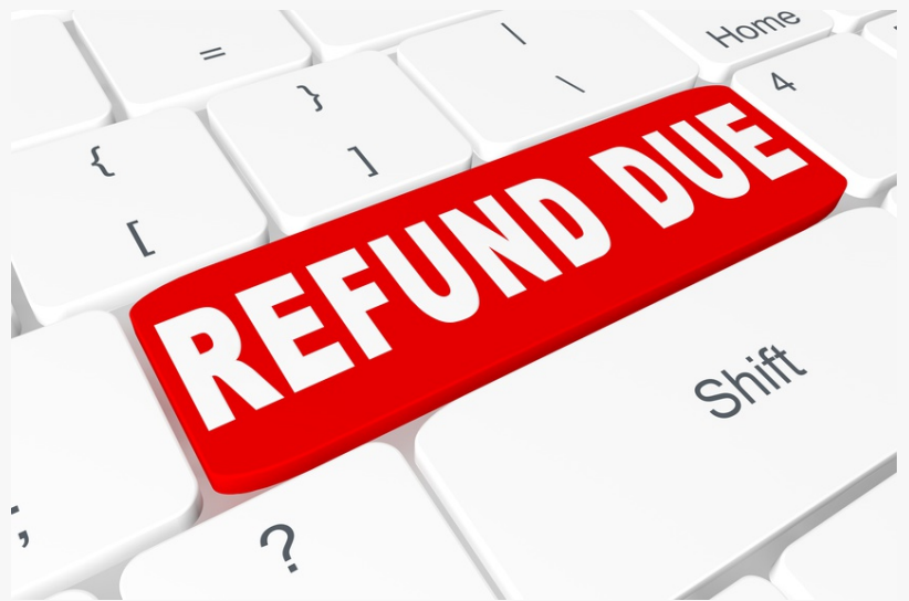
Estimate tax refund online