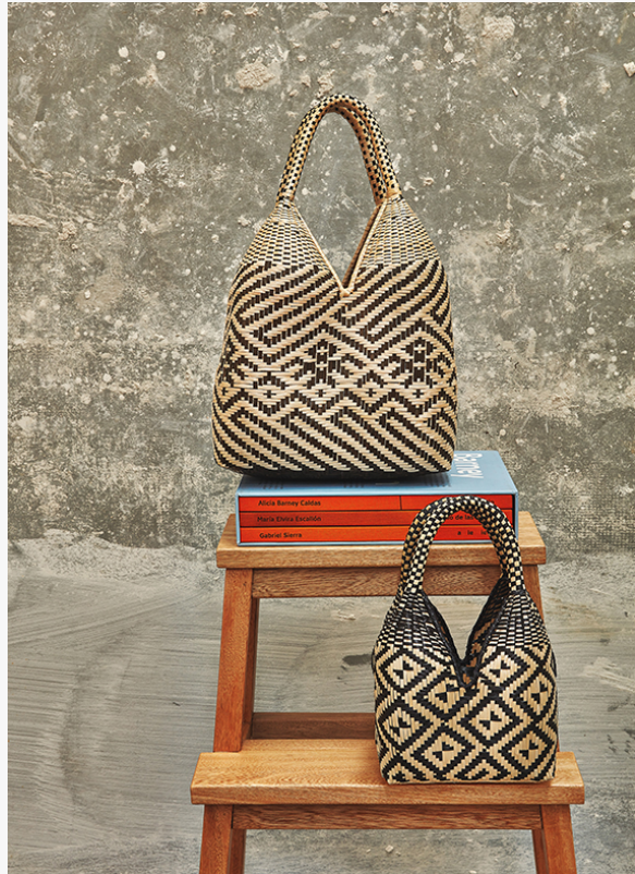
Four tits baskets, Eperara Siapidara community in Guapi (Cauca)

For more Information: FLIC Media email us here