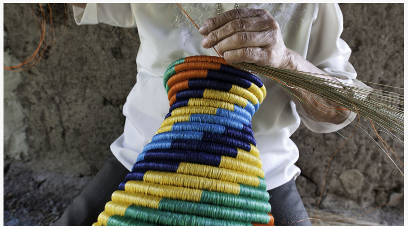
Macaw roll basketry (Boyacá)