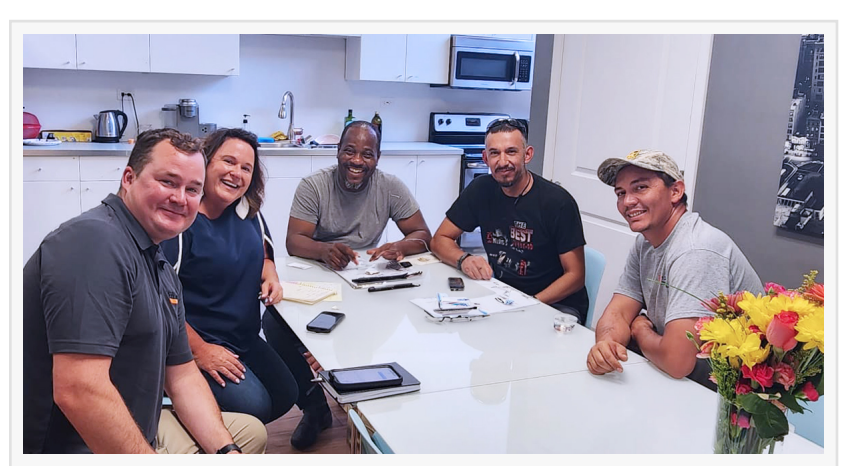
123 Remodeling + Home Depot Partnership

As a leading renovation company known for its superior craftsmanship and customer-centric approach, 123 Remodeling constantly seeks innovative ways to enhance the remodeling experience for its clients. The partnership with Home Depot exemplifies this commitment, enabling 123 Remodeling to offer an unparalleled range of construction materials and products, further