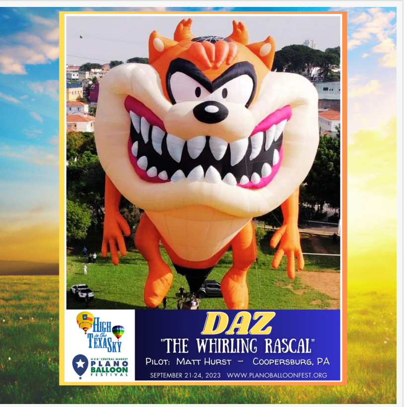
DAZ - The Whirling Rascal special shape hot air balloon at the H-E-B | Central Market Plano Balloon Festival open September 21-24, 2023.

The H-E-B | Central Market Plano Balloon Festival is sponsored by H-E-B, Central Market, RE/MAX, the City of Plano, Dos Equis, FOX 4 and MORE 27. More information is available at <u>www.planoballoonfest.org</u> and also posted to Facebook and Instagram.