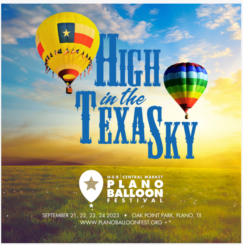
2023 H-E-B | Central Market Plano Balloon Festival Promo