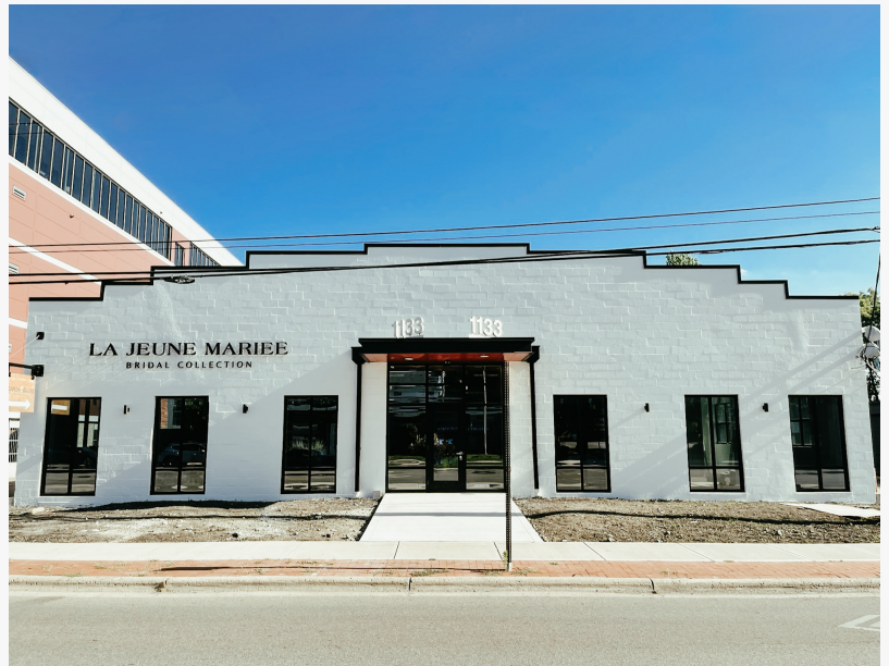
La Jeune Mariee's Storefront at 1133 Goodale Boulevard in Grandview, Ohio

By the end of August 2023, La Jeune Mariee Bridal Collection will grace 1133 Goodale Boulevard with their stunning selection of designer gowns and a shopping experience that manifests inclusive luxury.