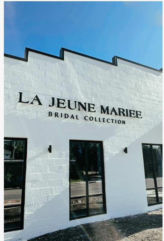
La Jeune Mariee's New Storefront