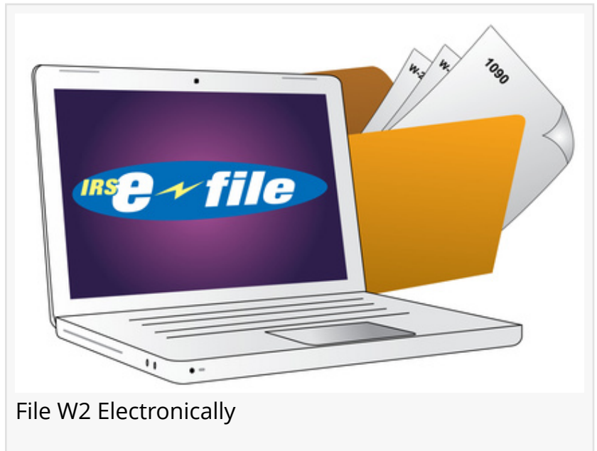
File W2 Electronically

Proceed with Tax Filing: Once having retrieved the W-2 form using TurboTax, proceed with filing taxes confidently . The platform will guide users through the process ensuring an accurate tax return.