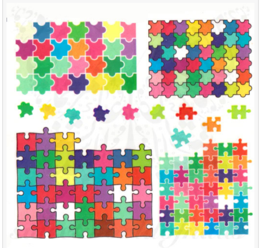
sweetworldofnails puzzle nail art Water decals