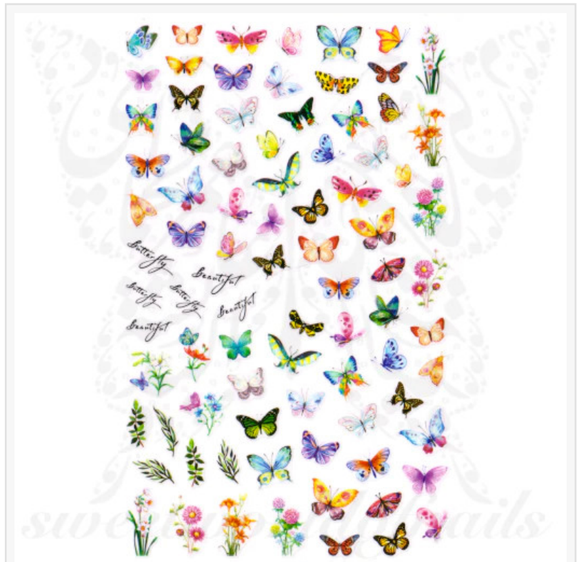
Sweetworldofnails Butterflies Nails Stickers

SweetWorldofNails SweetWorldofNails email us here