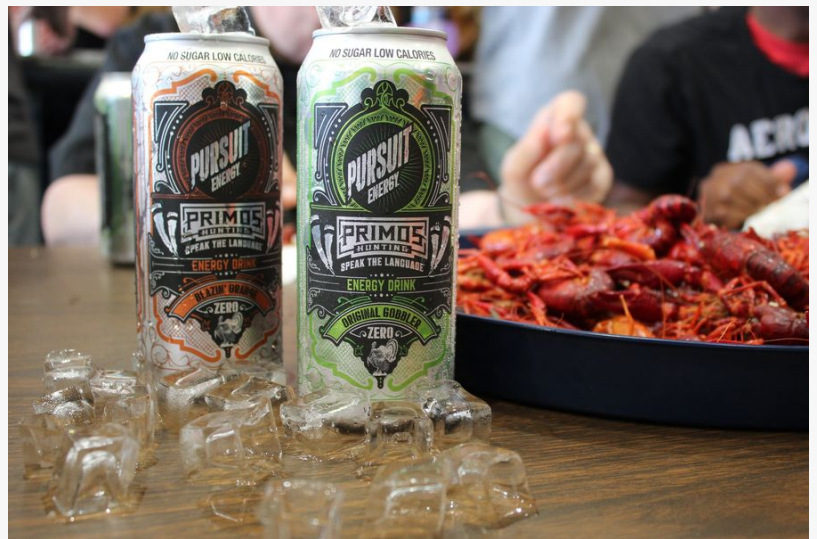
Primos Energy at a crawfish boil.