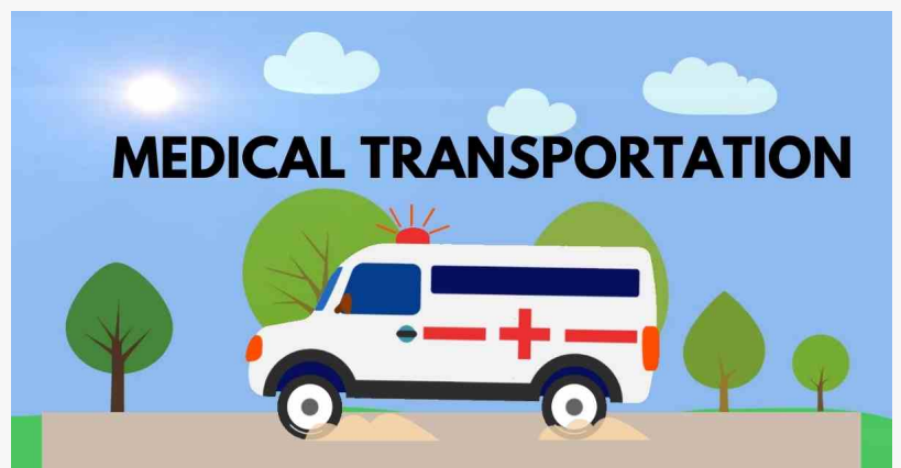
Beyond Ride Seattle